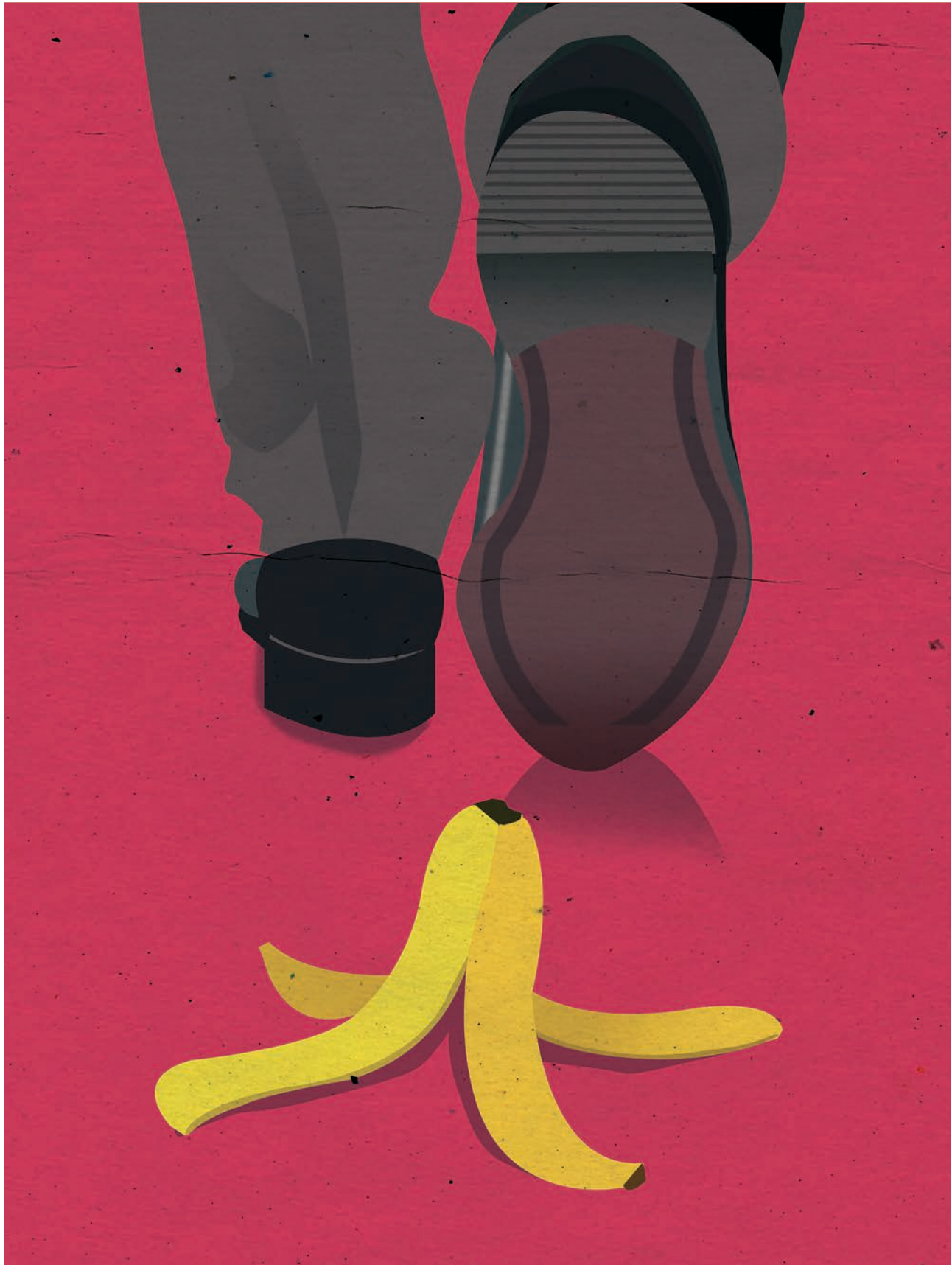
illustration by swapnil reedkar